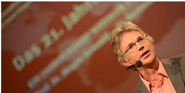
Abbildung 23