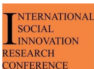
Abbildung 2 http://www.socialfirmsuk.co.uk/events/3rd-international-social-innovation-research-conference-isirc