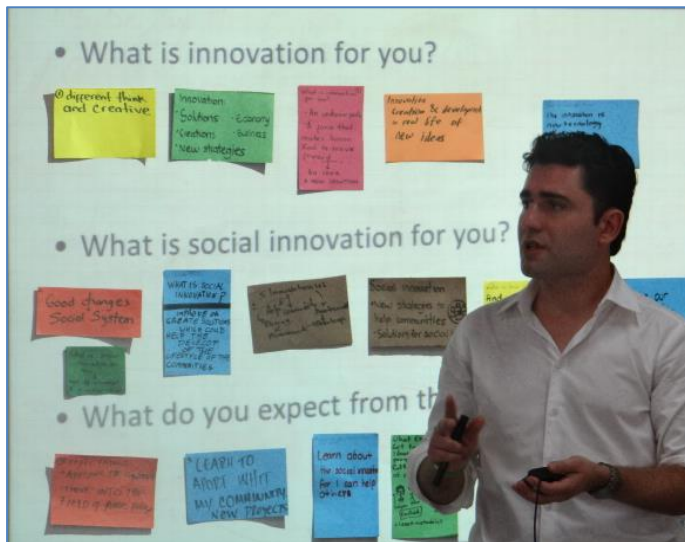
Abbildung 20

In July 2013 the Universidad Nacional de Colombia (UNAL) organized two weeks of idea generation and project development.