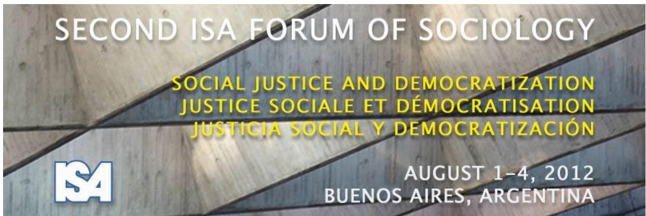
Abbildung 10 http://www.isa-sociology.org/buenos-aires-2012/img/banner_forum_2012_850-175.jpg