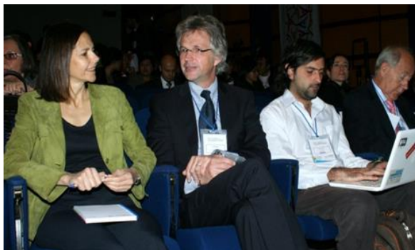
Abbildung 7