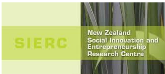
Abbildung 5 http://sierc.massey.ac.nz/

“Extending Theory, Integrating Practice” was the theme of the international conference that was organized by the New Zealand Social Innovation and Entrepreneurship Research Centre from 1st to 3rd December 2011.